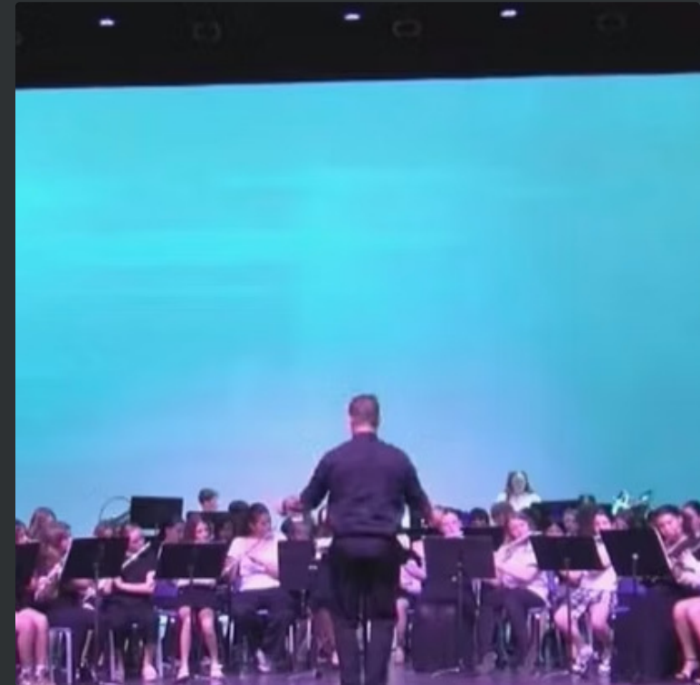
LTES Spring Concert

5th & 6th graders rotated through cafeteria games reviewing NJSLA skills. 20+ parent volunteers helped run the fun — PTA provided prizes!